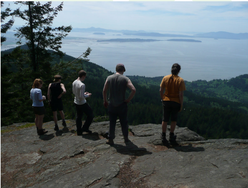
View-struck hikers atop Oyster Dome.